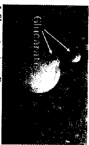
1. Gluconate enters cells.