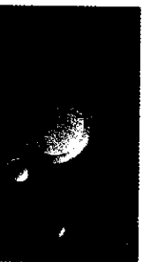
5. Gluconate from cells binds with the enzyme, preventing its harmful actions.

produced in our bodies naturally in fruits and vegetables. Additional amounts of gluconate are especially important for individuals who are exposed to more harmful chemicals, such as cigarette smoke and individuals who have a high risk for certain cancers, like breast, lung and prostate cancer. The typical American diet does not include enough fruits and vegetables to maintain an effective level of gluconate; therefore, additional amounts can only help the body fight the harmful chemicals.