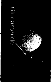
3. Through glucuronidation, harmful substances are removed from cells, made water soluble and eliminated from body.